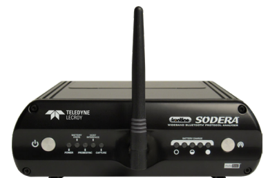
The Frontline Harmony LE Tester includes the powerful Frontline Soderia Bluetooth Protocol Analyzer

Knowing that your IUT failed a test is important for conformance, but the Harmony LE Tester provides more than just a pass, fail or inconclusive result for conformance certification - it is a sophisticated protocol analysis and tester platform, providing test case logging and debugging. The Harmony LE Tester summarizes and helps to pinpoint the cause of a fail or inconclusive verdict with detailed information to help understand and debug each failure.